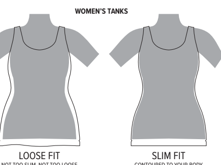
CONTOURED TO YOUR BODY LIGHT WEIGHT